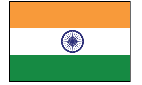
India August 2024