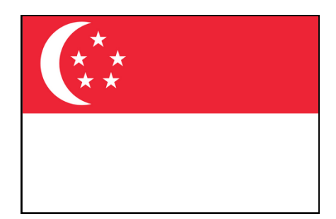
Singapore January 2024

Countries Malaysia Airlines NDC content is available in